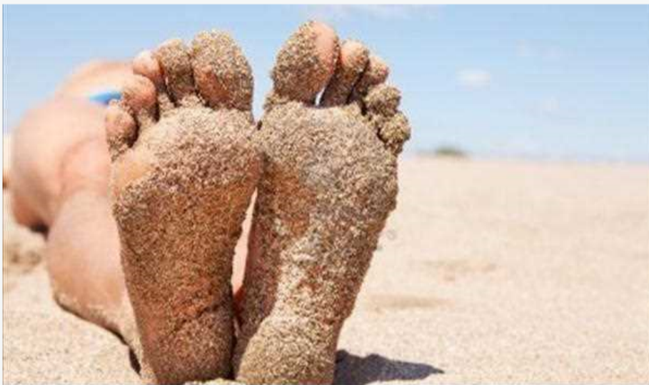
GoutUric AcidUricGout MedicineColchicine GoutGout GoutGout

The main help which the Colchicine does is that it reduces the intensity of uric acid in the blood which in turn prevents the formation of the crystals thereby disables our body to react to the impact of uric acid. So, in this way Colchicine helps us to be able to stay away from gout. But despite this edge, you should not use Colchicine as a medicine for long term treatment for gout. That only provides a momentary relief from the disease but is not suitable for the extended treatment.