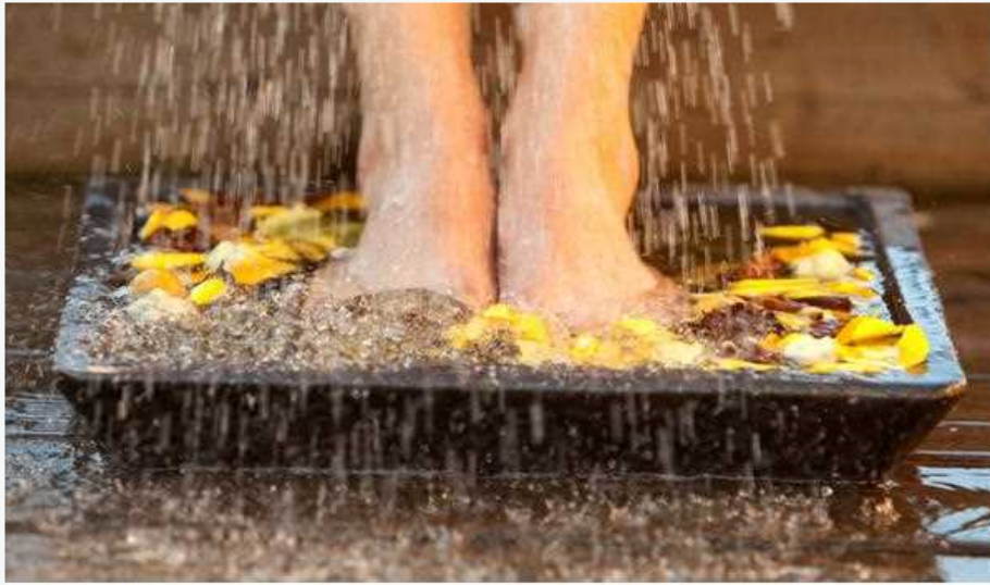
Gout Uric Acid Uric Gout Attacks Gouty Arthritis Purines