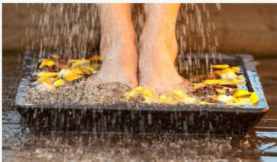
GoutUric AcidUricGout AttacksGouty ArthritisPurines

“ When an individual experiences an very painful attack that is along with joint irritation they are experiencing gouty arthritis or gout attacks . The joint inflammation will be due to the deposits of uric acid crystals which are in the joint liquid and the joint lining. When the joint inflammation is intense it is because the white blood cells are overpowering the uric acid crystals and releasing chemicals that are causing pain, inflammation of the joint tissues, and heat.