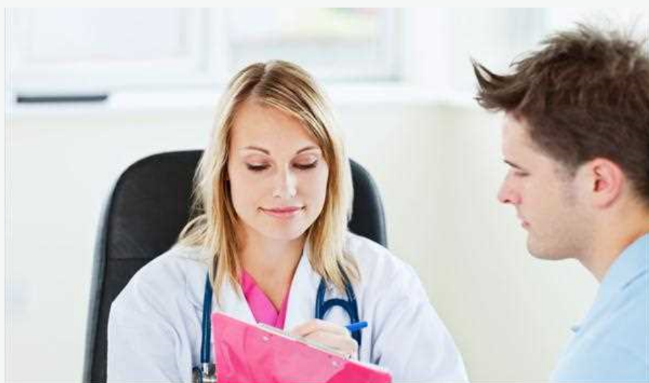
GoutUric AcidUricTreating GoutGout Patients

Consuming alcohol on a daily basis is definitely not good since it increases the risk of gout related issues. Alcohol and Beer has a high content of purine that thrusts the amount of uric acid in the system. Therefore staying away from alcohol is the wisest thing to do especially for those who are suffering from gout.