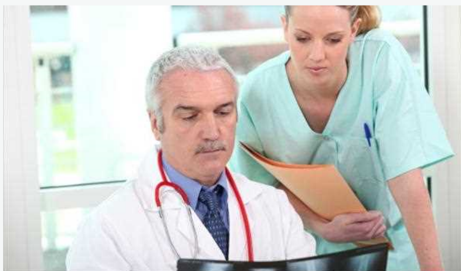
GoutPurinesUric AcidGout GoutUric