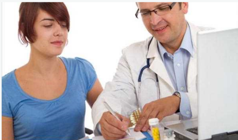
GoutUric AcidUricUric Acid LevelGout Symptoms

“ Most of well-known drugs for gout first wipes out the pain and the bloating and helps maintain the uric acid amount. However, no level of medication can definitely cure gout it would just try to aid the prevention of an attack from repeating by maintaining the uric acid level at a usual rate. This is why, it is so crucial to work hard to keep yourself healthful as you mature nearly all of illness that you'll manifest as we grow old can promote troubles that could worsen. It's also far better to be aware of your diet program and fitness. Eating the proper food and steering clear of food that can lead to an come across is very handy.